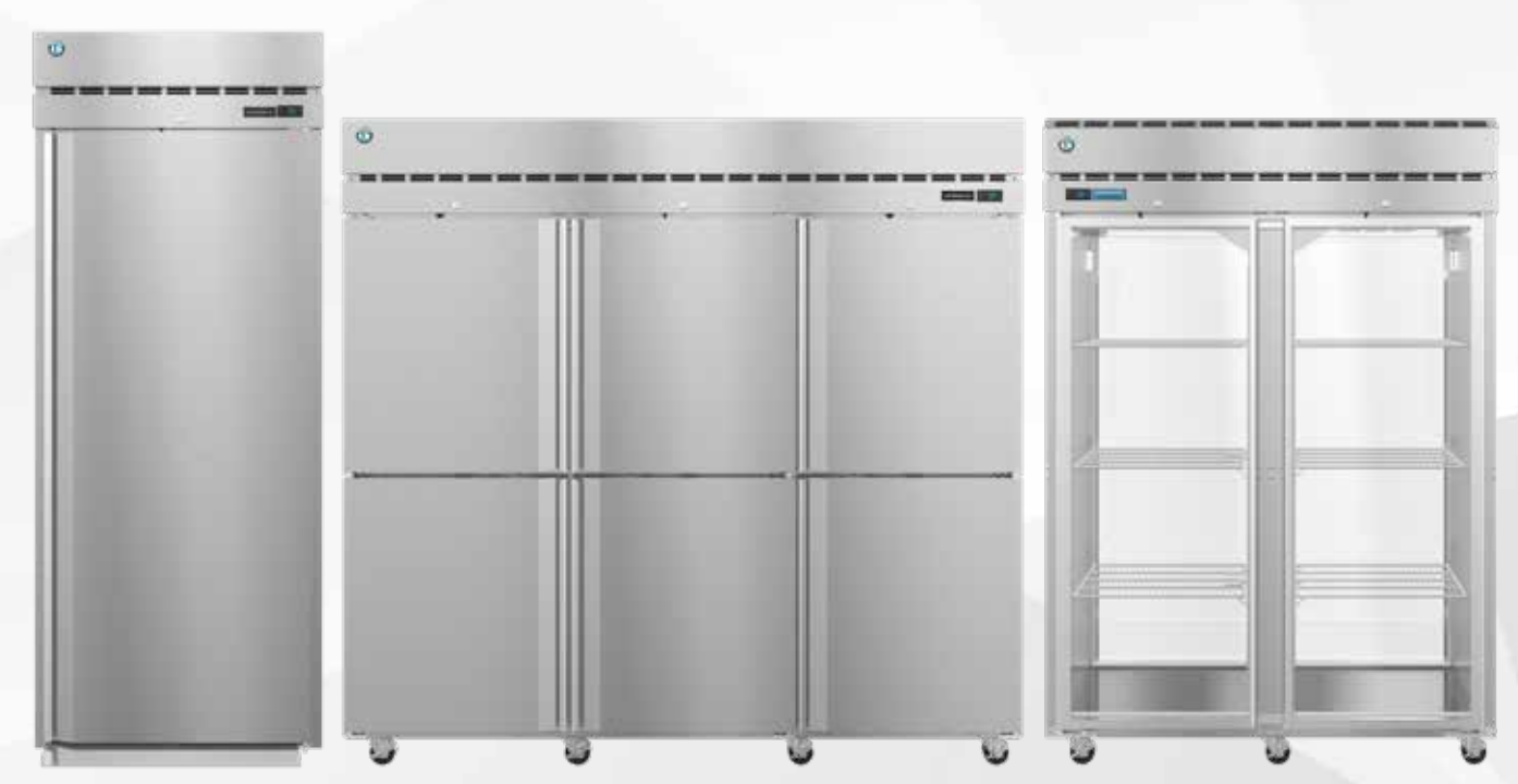
Reach-Ins, Pass-Thrus, Roll-Ins, Roll-Thrus, Dual Temps

Engineered to meet the tough demands of commercial kitchens, Steelheart reach-ins offer rugged, stainless steel construction inside and out for the highest quality, durability, performance and sanitation. When space is tight, remember that Hoshizaki reach-ins, dual temps and pass-thrus can roll through standard doors for easy installation.