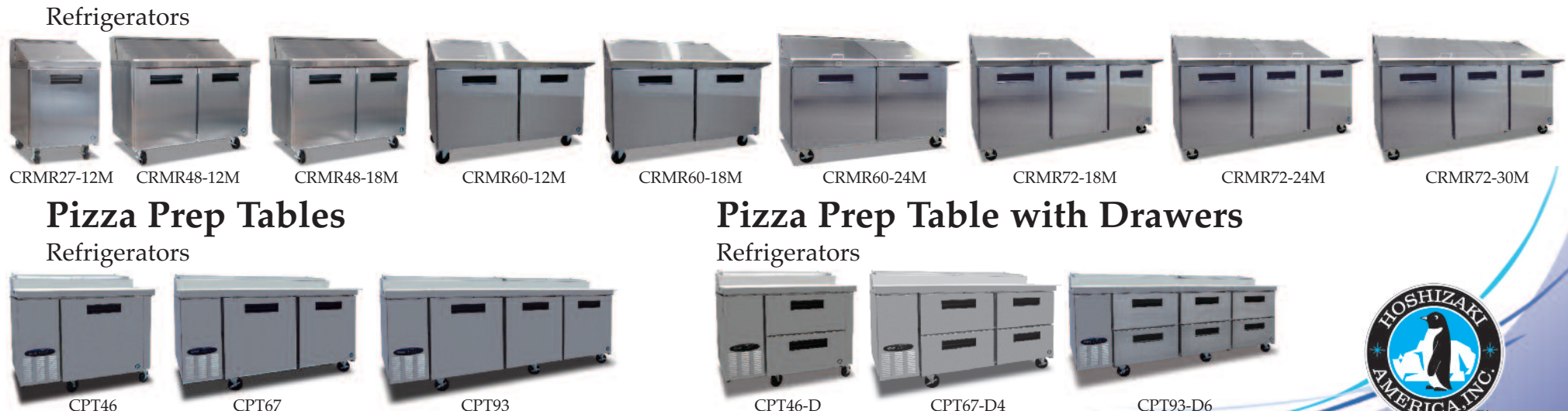
Hoshizaki America, Inc. - "A Superior Degree of Reliability"