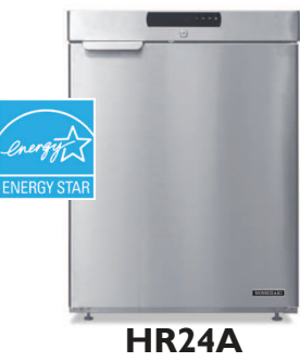
23.4"W x 24.5"D x 32.7"H

Offering a wide variety of Upright, Pass Thru, Undercounter and Worktop Refrigerators and Freezers for your refrigeration storage needs.