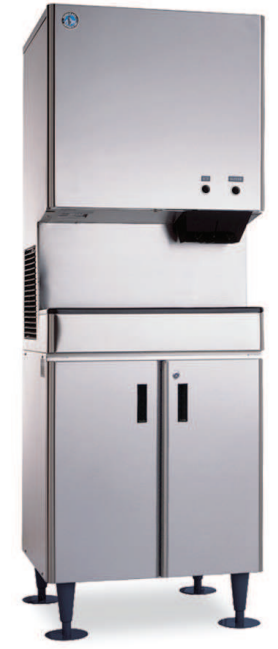
DCM-500-BAH-OS 26"W × 22.5"D × 72.8*"H (*height includes SD-500 Stand)

Hands-Free Cubelet Ice Machine and Water Dispenser Shown on an SD-500 Stand with locking doors (shown above)