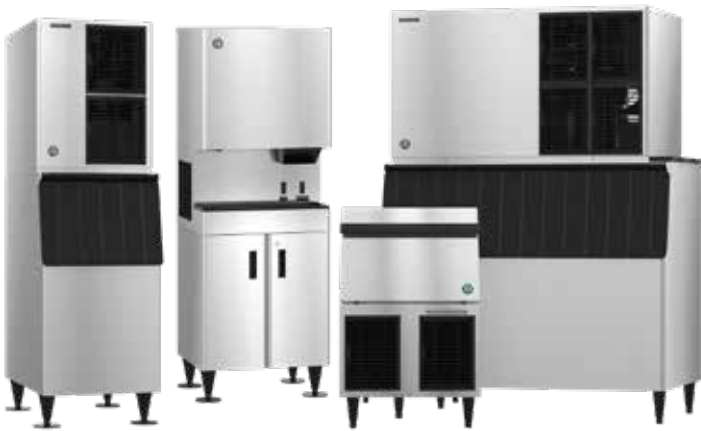
KM-520MAJ★ on B-300SF