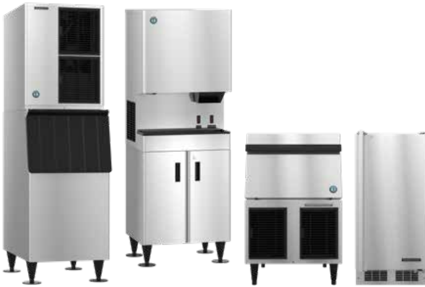
KM-520MAH on B-300