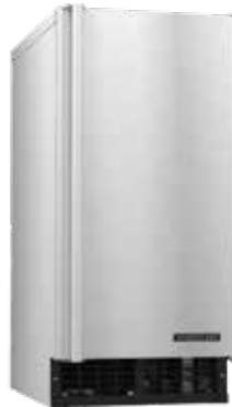
C-80BAJ(-AD/-DS) Cubelet Ice Machine with Built-In Storage Bin

14.8"W x 22.6"D x 33.5"H 31.5"H (-AD option)