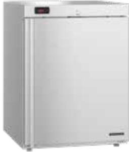
HR24C★ Compact Undercounter Refrigerator

Hoshizaki offers a variety of products for the business & industry, hospitality and healthcare segments. Undercounter ice machines, refrigerators and freezers provide several dependable options for breakrooms, hospitality areas, nursing stations, stadium boxes and more.