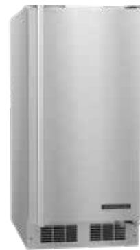
HR15A★ Compact Undercounter Refrigerator

14.8"W x 22.6"D x 33.5"H 31.5"H (-AD option)