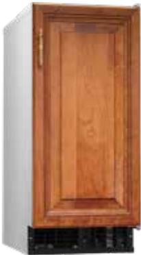
AM-50BAJ(-AD/-DS) Cuber Ice Machine with Built-In Storage Bin

14.8"W x 22.6"D x 33.5"H 31.5"H (-AD option)