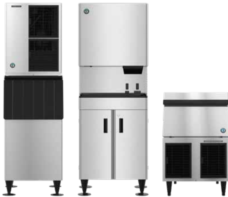
KM-520MAJ on B-300