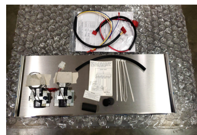
(Example of SP-5550 shown with parts and instructions)

Kit includes: Opti-Serve apron panel assembly (includes OS sensors with connectors), plastic insert, insulation tubing, nylon tie, wiring label, conversion label, Hoshizaki OptiServe Instruction Manual